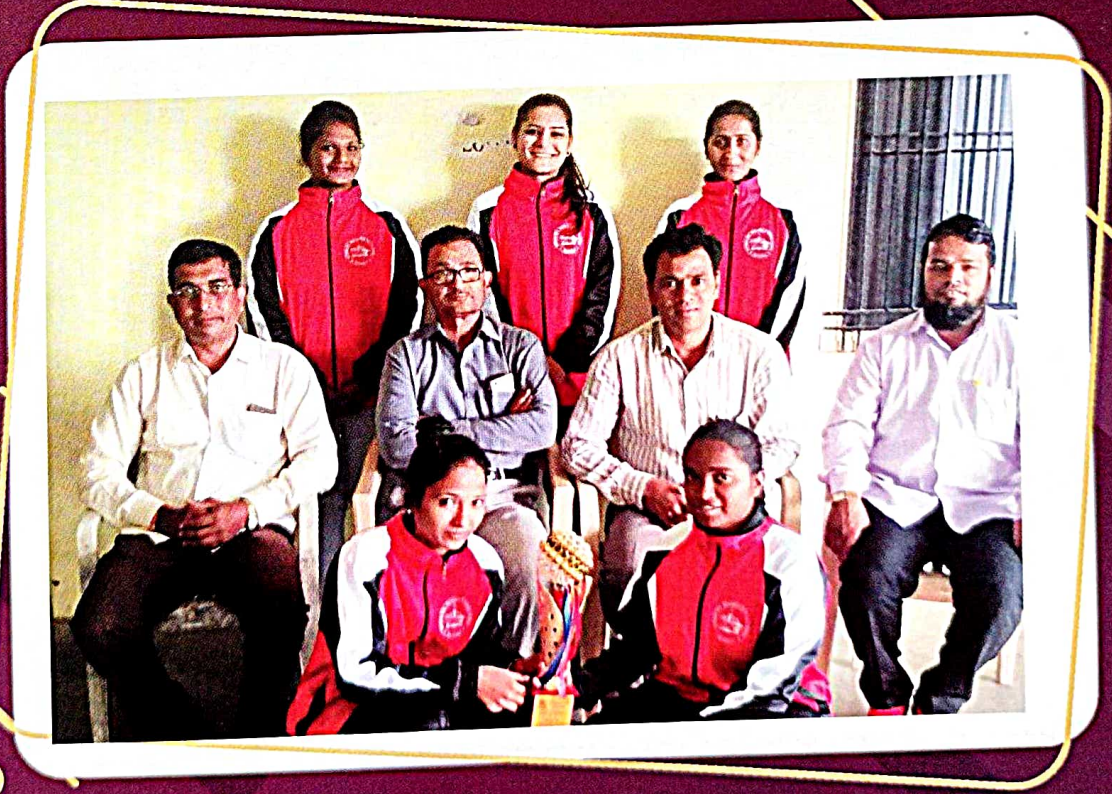
INTER COLLEGIATE BASKET BALL WOMENS WINNING TEAM