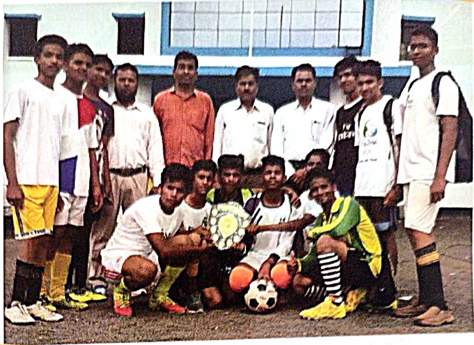
INTER COLLEGIATE VOLLEYBALL WINNING TEAM