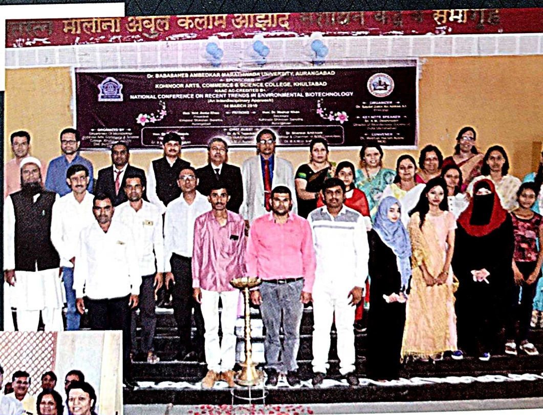
Organized National Conference On Recent Trends in Environmental Bio Technology