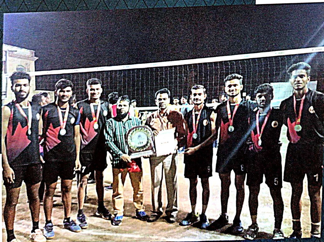
Volleyball Team University Runner Up.