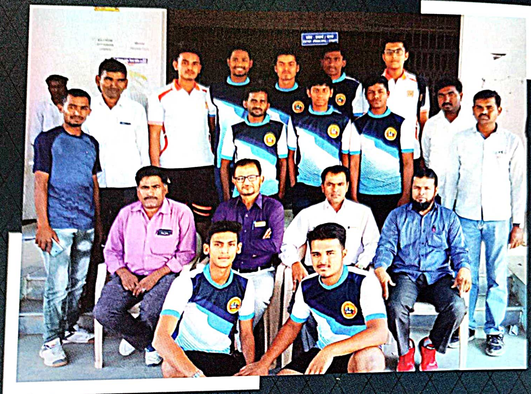
Hand Ball Junior College State Level Winner.